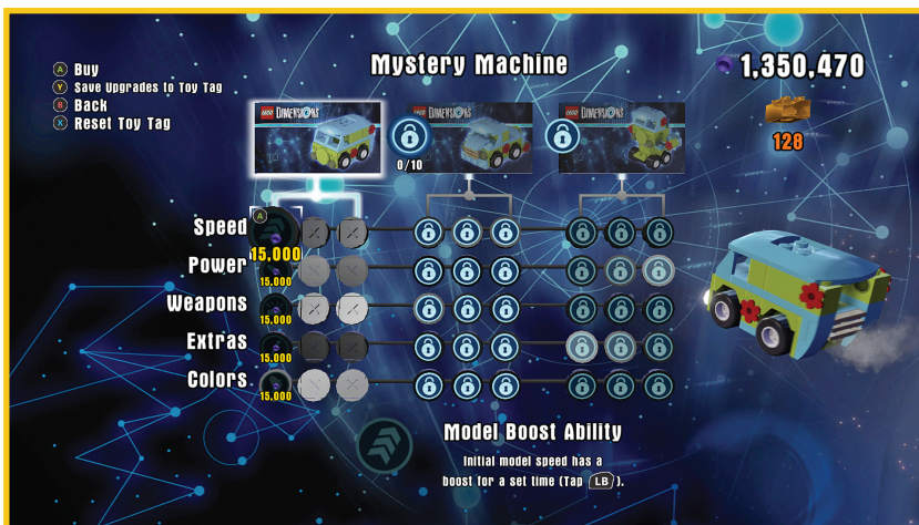
FIGURE B.3 The vehicle's upgrade screen offers lots of options.

Note on the vehicle's upgrade screen that there are three different models running along the top (beneath the name of the vehicle). Two of the models will have a lock symbol if you have not purchased a certain number of upgrades to the previous model. In