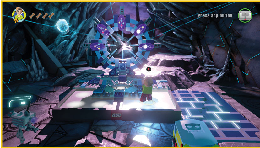
FIGURE B.2 Access the Vorton computer by stepping onto the Toy Pad.