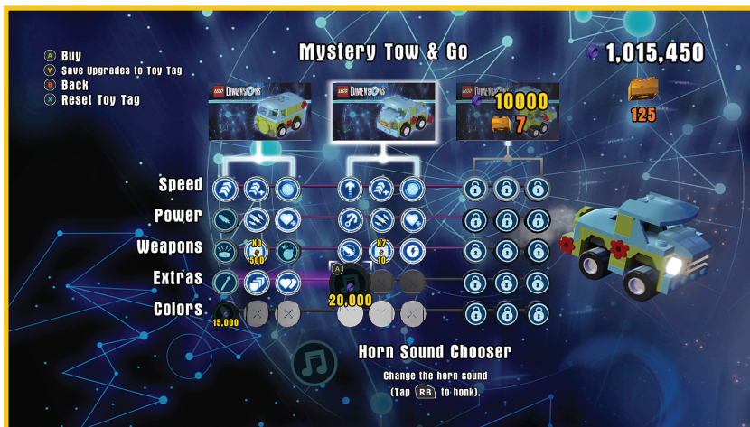
FIGURE B.5 The final model offers much more costly upgrades.