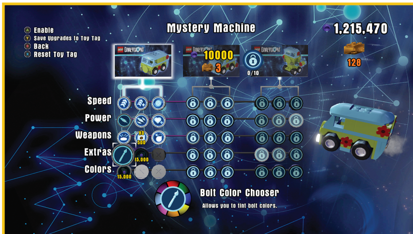
FIGURE B.4 Additional models become available for purchase.

As you can see in Figure B.4, 10 upgrades have been made to the basic Mystery Machine; these purchases are indicated by small blue icons, with up to three icons per upgrade. Once a sufficient number of upgrades have been made, another model becomes available. Figure B.4 shows that the middle model, Mystery Tow & Go, is available, and it will cost 10,000 studs and 3 gold bricks to purchase it before you can make any upgrades to it. You can see that you will have to make 10 upgrades to the Mystery Tow & Go before you can unlock the third model, Mystery Monster.