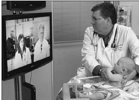
Figure 12-5 Doctors in Adena Health System Use High-Definition Video to Provide Neonatal Care

As Adena Health System focuses on enhancing patient care, delivering cost savings, and increasing productivity, they are exploring other advanced uses of video. One area being explored is virtual classrooms in the campus near the medical center. The campus will comprise a four-year nursing school in collaboration with Wright State University in Dayton, Ohio University in Athens, and other Adena educational partners. In these virtual classrooms, physicians from anywhere in the world will use a telemedicine application to teach remote students. The new facility will also support video recording and broadcasting.