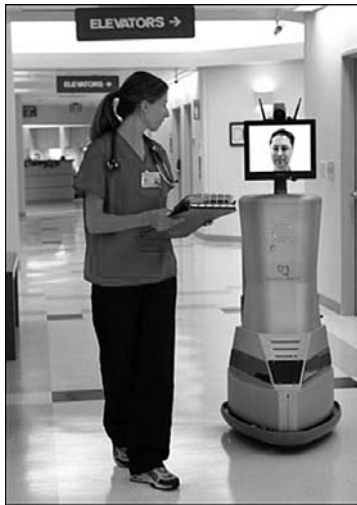
Figure 12-2 InTouch Remote Presence Robot Enables Doctor and Nurse to Discuss Patient Case

UCLA and Johns Hopkins are world-renowned medical facilities; they stay that way in part because they focus on using innovative approaches to treatment. In the past few years, both organizations have begun to use remote presence robots to improve patient care. With systems from a company called InTouch Technologies, doctors can now project themselves to another location via remote-controlled mobile robots, which enable them to move, see, hear, and talk as though they were actually there (see Figure 12-2).