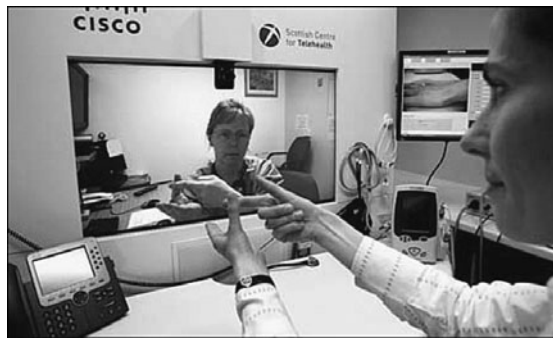
Figure 12-6 Cisco HealthPresence Enables Patients and Medical Staff to Meet Virtually “Face to Face”

Cisco HealthPresence combines life-size high-definition video, rich audio, and call-center technology to create a virtual face-to-face experience for patients and caregivers who are remote from each other (see Figure 12-6). The HealthPresence platform also interfaces with medical diagnostic equipment, such as stethoscopes and otoscopes, and monitors that can measure weight, blood pressure, temperature, pulse rate, and lung function to capture the physiological condition of the patient. An attendant is available to operate the medical devices on behalf of the caregiver/patient and to maintain the technology.