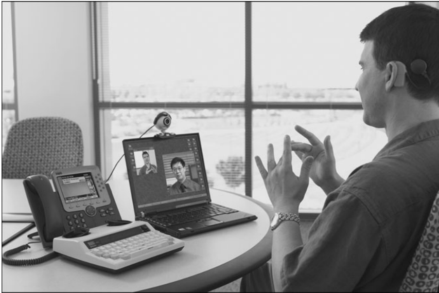
Figure 12-8 Sign Language Interpretation Being Provided over Video

commitment to patient services, good use of taxpayer dollars, and compliance with regulatory requirements such as equal access laws. Figure 12-8 shows video interpretation being conducted using sign language.