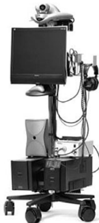
Figure 12-7 Patients and Physicians Can Talk with One of Many Skilled Interpreters Using Portable, Rollabout Video Carts