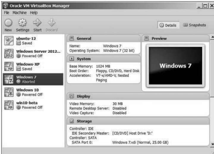
FIGURE 13.2 VirtualBox Manager window

the hardware and therefore run less efficiently. Examples of this include Microsoft Virtual PC and Oracle VirtualBox. Figure 13.2 shows an example of VirtualBox. You will note that it has a variety of virtual machines inside, such as Windows 7, Windows Server, and Linux Ubuntu.