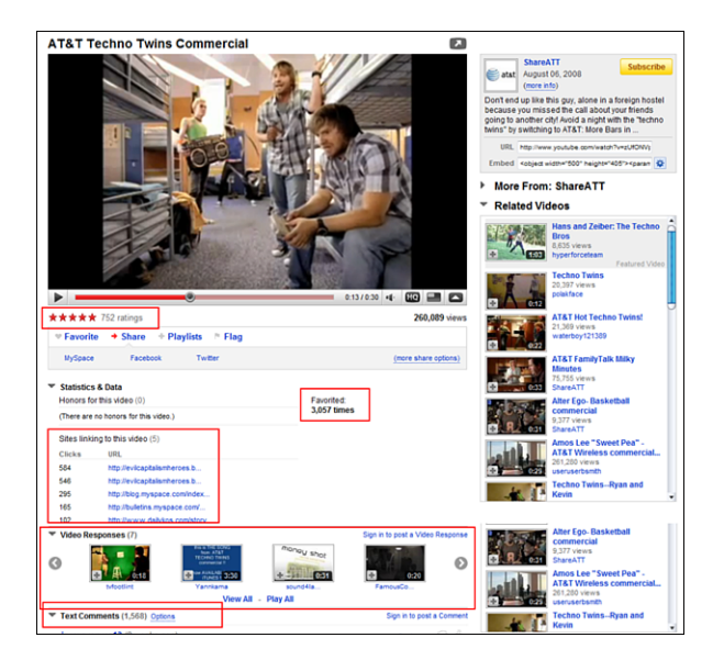
Figure 6.1 AT&T Techno Twins Video on YouTube.