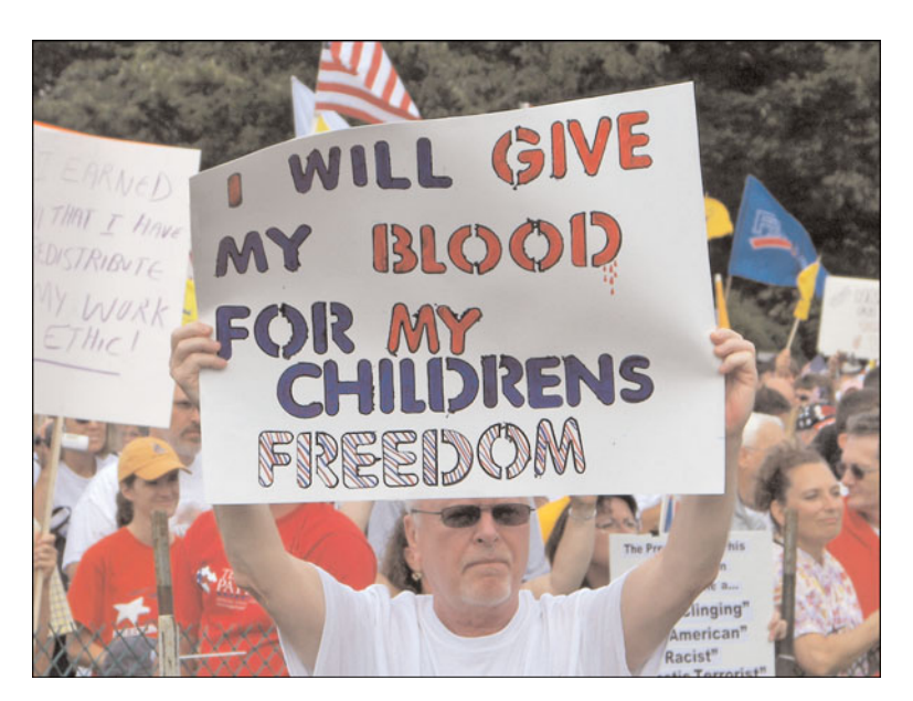
Figure 5.4 A Tea Party protester holds up a sign reading "I WILL GIVE MY BLOOD FOR MY CHILDRENS[sic] FREEDOM."

The 2009 Tea Party protests, initially organized in response to the 2008-2009 U.S. government bailouts of the banking and insurance industries, were tainted by an attendance and a rhetoric that overlapped with the violent paramilitary "patriot" movement (as shown in Figure 5.4). If you talk about killing and murder and bloodshed, even if you're speaking metaphorically, people are probably going to want to back away slowly.