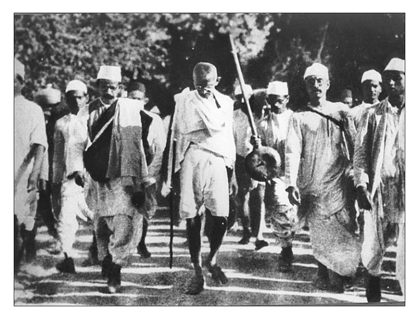
Figure 5.1 What makes Mahatma Gandhi's philosophy of passive resistance effective in most contexts is not its moral purity, but rather its efficacy. Even Martin Luther King Jr., Gandhi's most prominent ideological heir, did not fully support passive resistance until it was proven effective during the Montgomery Bus Boycott.

This is important. Alinsky brings up the example of terrorism—fighting a government by taking civilian hostages and blowing stuff (and people) up is always wrong, right? Well, Mahatma Gandhi (see Figure 5.1)—arguably the most effective activist of the twentieth century—thought so. But for the partisans who violently resisted the Nazis during World War II, partisans who would not have been able to do so by less radical means, violence was essential. Or we can look at Abraham Lincoln's pre-abolitionist argument that no state should or may secede against the United States because "a house divided against itself cannot stand." Wouldn't King George have been able to make the same argument prior to the American Revolution? (President Lincoln was in a much stronger position, morally, after he issued the Emancipation Proclamation and made abolition of slavery a clear part of the Union cause.)