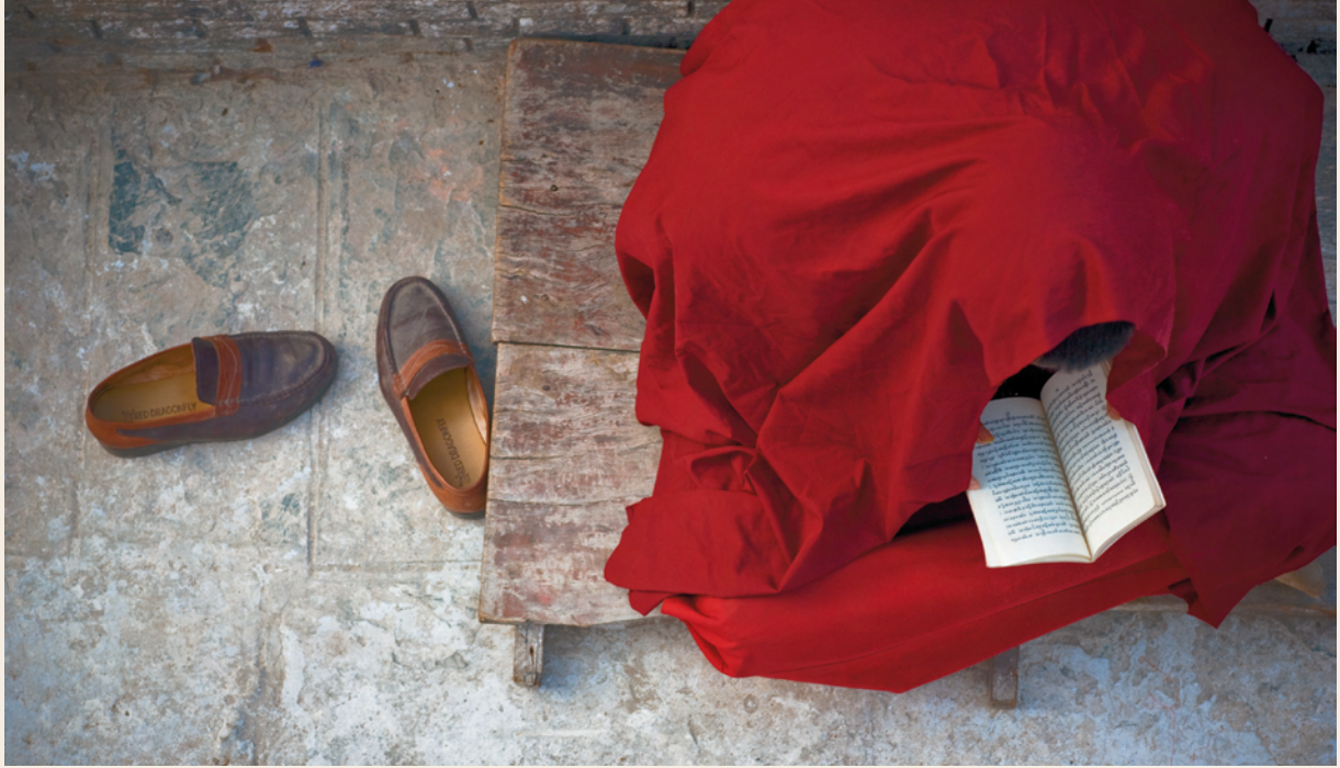
▲ Canon 5D, 85mm, 1/50 @ f/5.6, ISO 100

In the inner circle of the stupa, devotees and monks pray, read, and meditate. A medium shot like this brings the action in a little and provides you with a more intimate look into the details of the story. In this case, the robe, the empty shoes, and the sacred text all point toward Buddhism, the faith associated with this place.