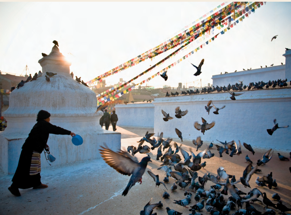
◀ Canon 5D, 27mm, 1/500 @ f/4, ISO 100

In the inner circle of the stupa, devotees and monks pray, read, and meditate. A medium shot like this brings the action in a little and provides you with a more intimate look into the details of the story. In this case, the robe, the empty shoes, and the sacred text all point toward Buddhism, the faith associated with this place.