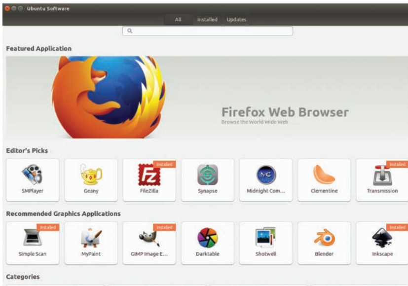
FIGURE 9.1 The initial Ubuntu Software screen enables you to browse through packages sorted by groups.

Installing new software via Ubuntu Software is as simple as finding it in the package list, double-clicking, and clicking the Install button. When you do so, you may be asked for your password; then the application is downloaded and installed. You can remove an application by finding it in Ubuntu Software and clicking the Remove button.