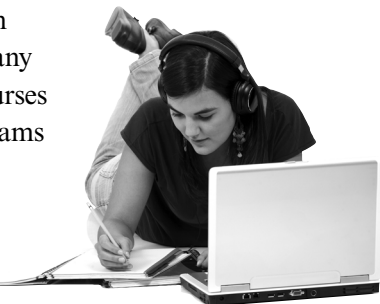
Table 1.1 describes the wide variation in types of online courses you may encounter, with examples of the interactions employed and expected outcomes for each.

continuous, rolling, or open enrollments, in which students are allowed to enter and exit courses at any time. Other programs provide fully facilitated courses with set beginning and ending dates. Many programs use predeveloped curricula, others use teachercreated courses, and still others use some combination of the two. Some programs allow the use of interactive discussion forums and encourage student-tostudent interaction, while others do not.