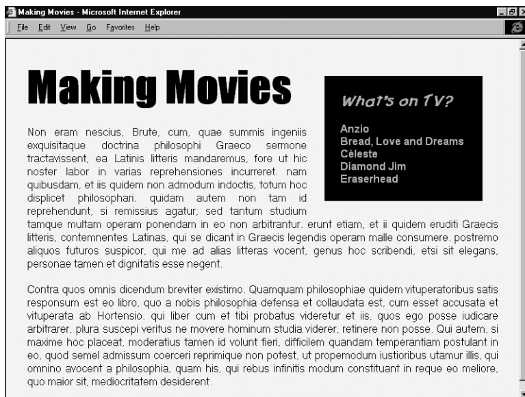
Figure 3.1 All lengths on this page are specified using ems.

By specifying the padding width in ems, the width of the padding is relative to the font size of the DIV element. As a designer, you don't really care what the exact width of the padding is on the user's screen; what you care about is the proportions of the page you are composing. If the font size of an element increases, the padding around the element should also increase. This is shown in Figure 3.2 where the font size of the menu has increased while the proportions remain constant.