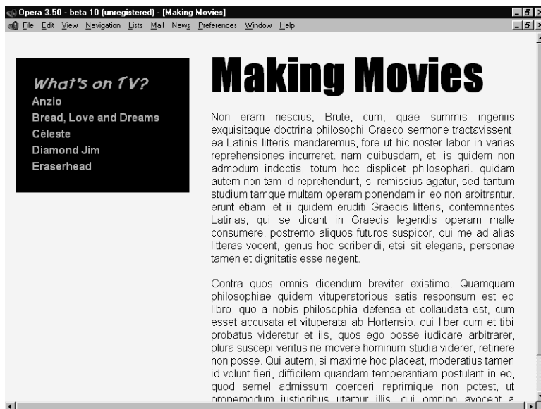
Figure 3.3 By changing a few lines in the style sheets, you can achieve a different design.

CSS, browsers whose users have turned off style sheets, or browsers that don't work visually at all, such as voice browsers and Braille browsers. Voice browsers may actually support CSS because CSS can also describe the style of spoken pages, but aural CSS (not described in this book) doesn't allow text to be spoken out of order.