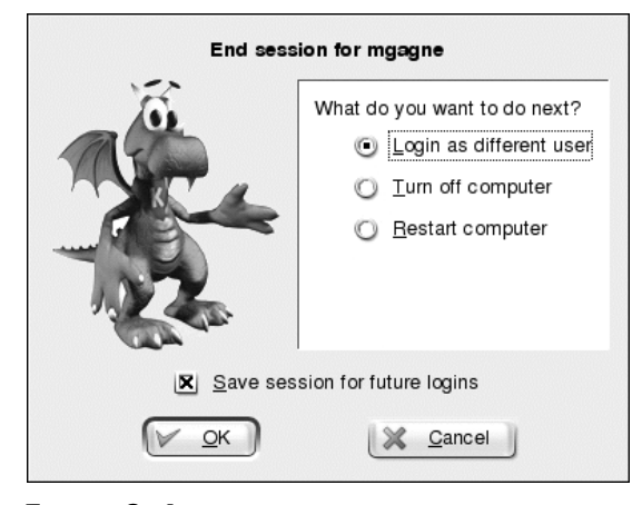
FIGURE 3-4 Available options when preparing to end a login session.

This particular logoff screen is from a SUSE system, but the types of options are similar regardless of which system you're on. At this point, select Turn Off Computer. There's rarely any need for choosing Restart Computer in the Linux world. When you shut down, it's usually because you intend to power off the system.