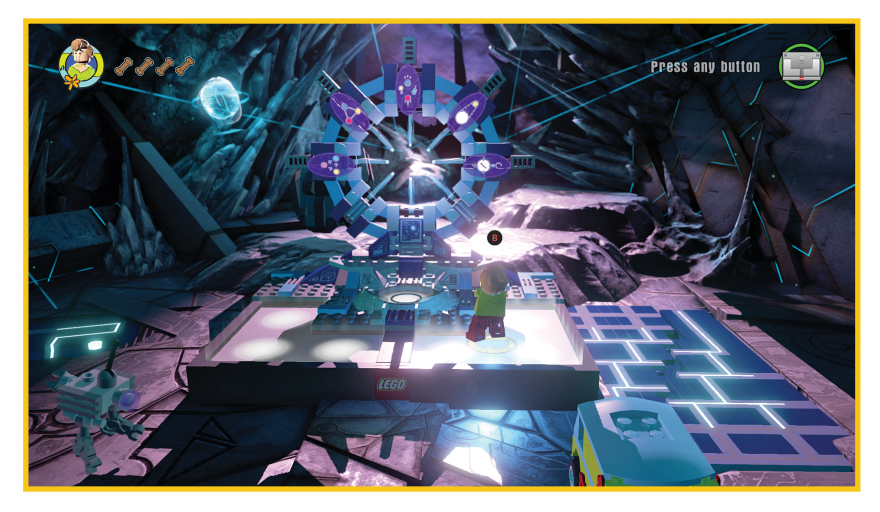
FIGURE B.2 Access the Vorton computer by stepping onto the Toy Pad.

The vehicle's upgrade screen appears, as shown in Figure B.3. Notice that the button controls are explained in the upper-left corner: Press Y to save any changes you make or B to return to the previous screen and not save changes. Pressing X resets the Toy Tag to the original vehicle's settings. Press the A button to buy an upgrade.