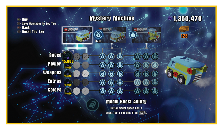
FIGURE B.3 The vehicle's upgrade screen offers lots of options.

The vehicle's upgrade screen appears, as shown in Figure B.3. Notice that the button controls are explained in the upper-left corner: Press Y to save any changes you make or B to return to the previous screen and not save changes. Pressing X resets the Toy Tag to the original vehicle's settings. Press the A button to buy an upgrade.