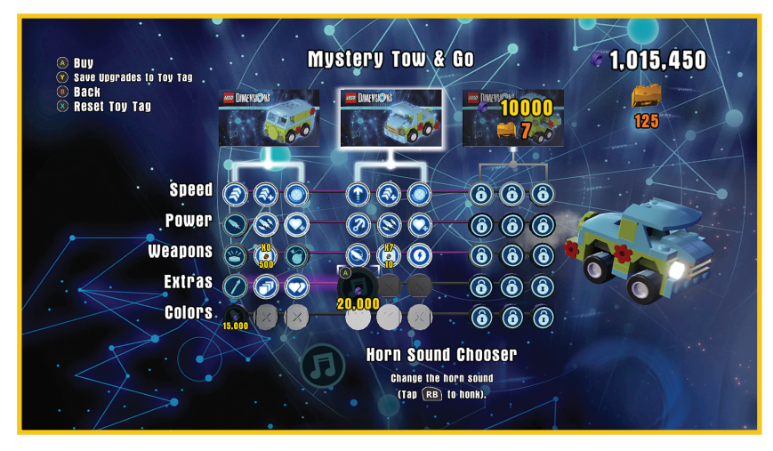
FIGURE B.5 The final model offers much more costly upgrades.

8. When you're finished making upgrades to any model, press Y to save your changes. Make certain the vehicle and its Toy Tag are placed on the round pad so the changes are saved to the Toy Tag.