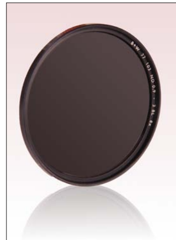
FIGURE 11.4 A B+W 77mm 0.9 ND filter.

To see more B+W filters, check out www.schneideroptics.com .