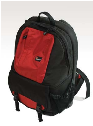
FIGURE 11.18 The Fastpack 250 from Lowepro.

You can check out the full line of Lowepro camera gear at www.lowepro.com .