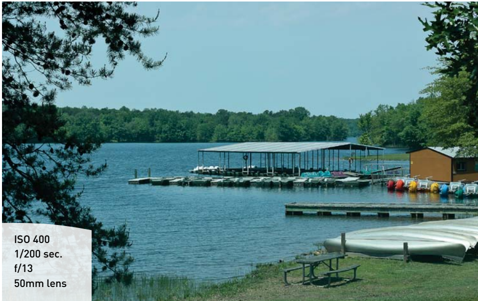
FIGURE 11.2 Without using the polarizing filter, the scene looks a little low on contrast and has a blue color cast from the sky.

enter the camera lens, they are scattering about, creating color casts and other effects. The polarizer controls how light waves are allowed to enter the camera, only letting certain ones pass through. So what does that mean for you? Polarizing filters will make blue skies appear darker, vegetation color will be more accurate, colors will look more saturated, haze will be reduced, and images can look sharper (Figures 11.2 and 11.3). Not bad for a little piece of glass.