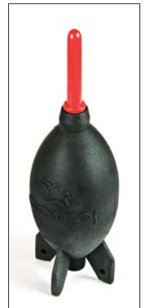
FIGURE 11.22 The Giottos Rocket-Air dust blower.