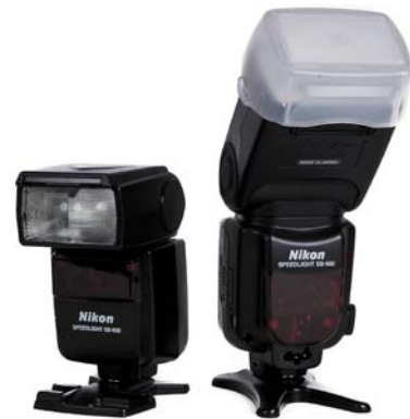
FIGURE 11.16 The Nikon SB-600 and SB-900 Speedlights will add power and flexibility to your flash photography.

Nikon currently has several Speedlight flashes for sale, but my recommendation is that you purchase the SB-600 or, better still, the SB-900 Speedlight. They will run somewhere in the neighborhood of $220 for the SB-600 and $490 for the SB-900, which can be a pretty hard pill to swallow at first. The pill will go down much easier once you have used one of these powerful and flexible flashes. Not only will your on-camera flash photography be much better, but you also gain the option of moving to a wireless, off-camera flash system down the road. This is one of the reasons that the SB-900 is so much more expensive; it can be used as a commander unit to wirelessly control other Speedlights in the Nikon Creative Lighting System.