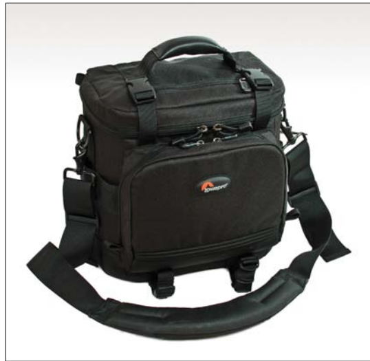
FIGURE 11.19 The Pro Mag 2 AW from Lowepro.