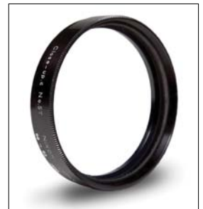
FIGURE 11.14 The Nikon +5 close-up filter.

Another great way to jump into macro work is by purchasing a close-up filter ( Figures 11.14 and 11.15 ). Close-up filters also come in varying magnifications but tend to be a little more expensive than extension tubes. This is because they are usually made of high-quality glass that works in concert with the lens. The filters and lenses can have some advantages over tubes, too. Because they