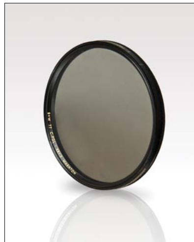
FIGURE 11.1 A B+W circular warming polarizing filter.

Here's the deal: light travels in straight lines, but the problem is that all those lines are moving in different directions. When they