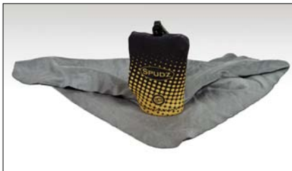
FIGURE 11.20 The Spudz microfiber cleaning cloth.

Some folks prefer to use canned, compressed air to blow away dust but they can sometimes release fluid when the can is tilted. For this reason, I always use my Rocket-Air Blower from Giottos (Figure 11.22). This funny-looking device is great for getting rid of tough dust, and it uses a clean air path so that the dust that you are blowing away doesn't get sucked into the ball and re-deposited back on your equipment the next time you use it.