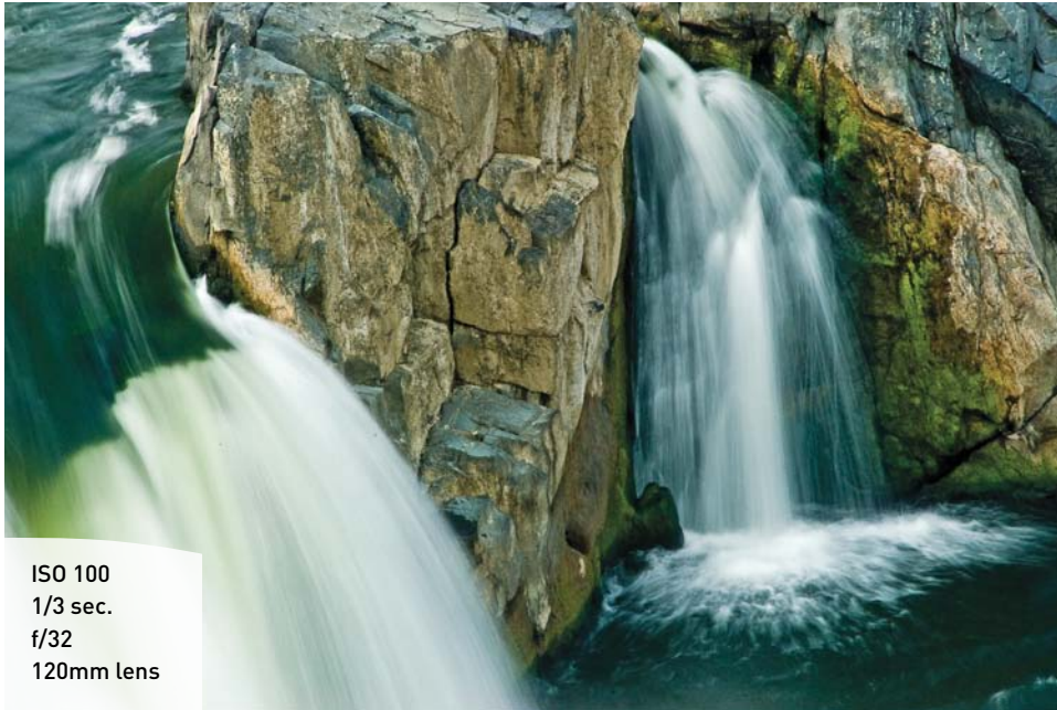
FIGURE 11.5 Using a .9 ND filter allowed me to use a long shutter speed in broad daylight to capture this silky smooth waterfall image.