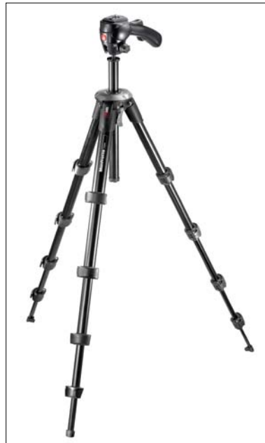
FIGURE 11.8 The Manfrotto 785SHB Modo tripod.