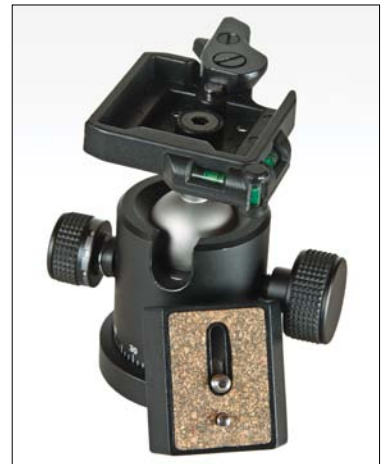
FIGURE 11.11 The quick release plate used on the Giotto's ball head.