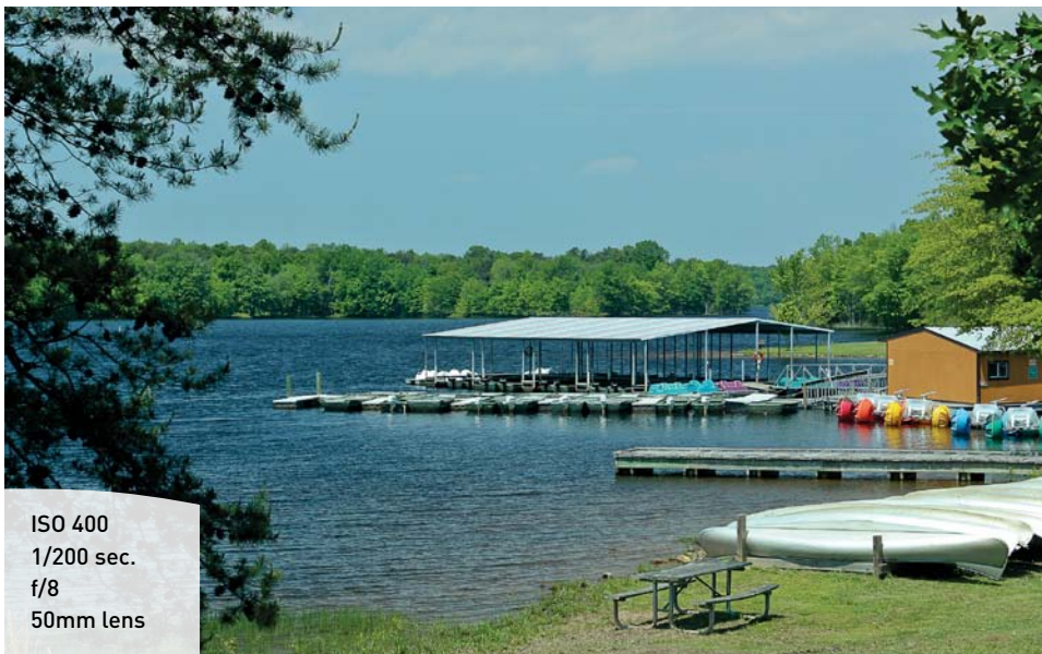
FIGURE 11.3 After adding a polarizer, the colors are much more accurate and the color cast is now gone.