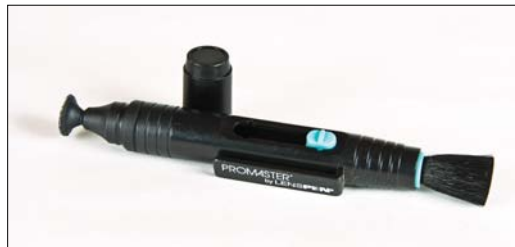
FIGURE 11.21 The LensPen lens cleaning tool.