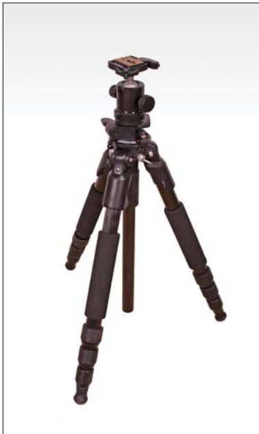
FIGURE 11.7 The Giottos MTL 22/32 tripod.

Make sure that the tripod extends to a height that is tall enough to allow you to shoot from a comfortable standing position. Nothing ruins a good shoot like a sore back. Taller tripods need to be sturdier to maintain a rigid base for your camera. You will also want to consider how low the tripod can go. If you want to do macro work of low-level subjects such as flowers, you will need to lower the tripod fairly close to