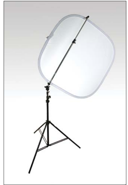
FIGURE 11.17 A 42" diffusion panel from Westcott.

You'll find more information on Westcott diffusion panels at www.fjwestcott.com .