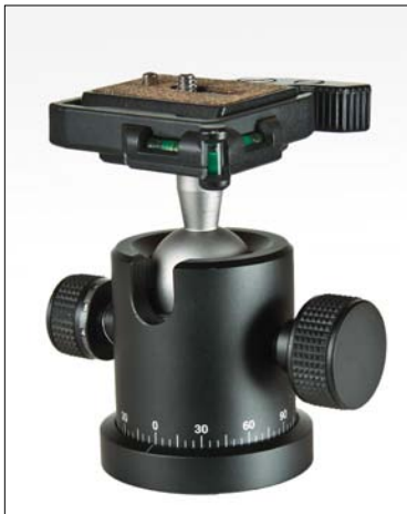
FIGURE 11.9 The Giotto's MH 1000-652 ball head.

The other thing to consider when purchasing a tripod is the leg locking system. Whether it is a lever-lock, locking rings, or some other system, make sure that you