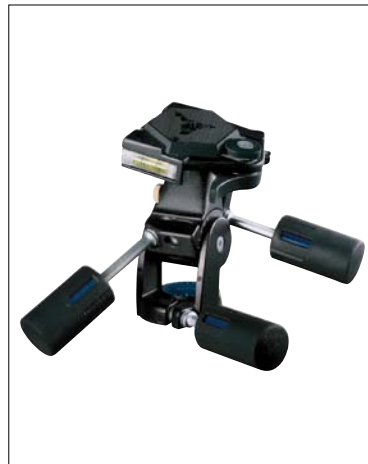
FIGURE 11.10 The Bogen 3047 pan/tilt tripod head.