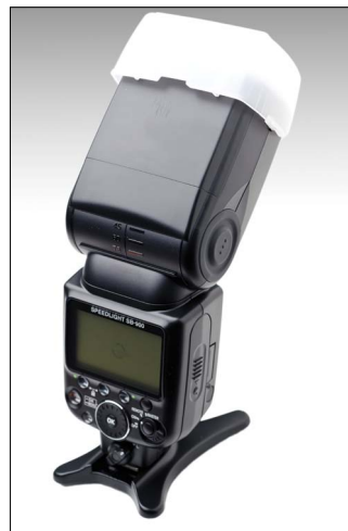
FIGURE 12.12 The Nikon SB-900 Speedlight.

Nikon currently has several Speedlight flashes for sale, but my recommendation is that you purchase the SB-700 or, better still, the SB-900 Speedlight ( Figure 12.12 ). They will run somewhere in the neighborhood of $320 for the SB-700 and $490 for the SB-900, which can be a pretty hard pill to swallow at first. The pill will go down much easier once you have used one of these powerful and flexible flashes. Not only will your on-camera flash photography be much better, but you also gain the option of moving to a wireless, off-camera flash system down the road.