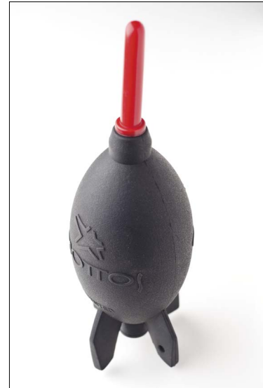
FIGURE 12.14 The Giottos Rocket-Air dust blower.

To check out all of the Hoodman accessories, head to www.hoodmanusa.com .