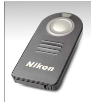
FIGURE 12.9 The Nikon ML-L3 wireless remote lets you activate the shutter without touching the camera.

When shooting long exposures, you can use the self-timer to activate the camera or you can get yourself a wireless remote or a cable release. The wireless Nikon ML-L3 (Figure 12.9) uses an infrared beam (just like your TV remote) to fire the shutter from a distance of up to around 16 feet. The Nikon MC-DC2 remote release cord, which is an electronic release, attaches to the camera via the remote port and lets you trip the shutter. A remote release is the preferred tool of choice when shooting with the camera set to Bulb (see Chapter 11). The idea of the release is that it allows shutter activation without having to place your hands on the camera. This is the best way to ensure that your images will not be influenced by self-induced camera shake. The ML-L3 sells for around $20 and the MC-DC2 for around $35, and both will not only work with the D3200 but with several other Nikon DSLR models on the market. A remote also comes in handy for shooting macro work, where the tiniest vibration can affect the sharpness of your image.