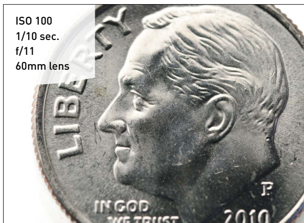
FIGURE 12.11 The Canon 500 D close-up filter on the Nikon 60mm 2.8 lens was used to help capture this dime.