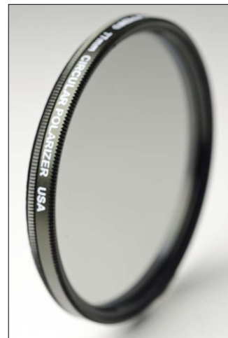
FIGURE 12.1 A Tiffen circular polarizing filter.

This one ranks right up there at the top of the list of must-own photography accessories. You won't find a self-respecting landscape photographer who doesn't have at least one polarizer in his or her camera bag ( Figure 12.1 ).