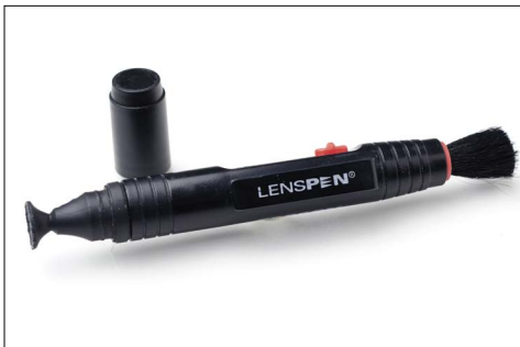
FIGURE 12.13 The LensPen lens cleaning tool.

More information on LensPen products can be found at www.lenspen.com .