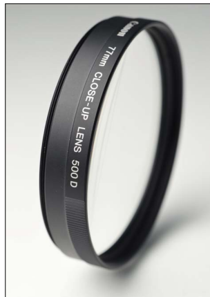
FIGURE 12.10 The Canon 500 D close-up filter. Yes, it's made by Canon, but since it is a screw-on filter it works with any camera model.

The other difference is that they are usually screw-threaded onto your lens, which means that you have to purchase a specific thread diameter. So if your favorite lens has a 68mm filter thread, this is the size you would use for the close-up filter. The big downside is that if you want to use different lenses that have different thread sizes, you will have to buy multiple filters. This is why I prefer to work with a zoom lens so that I can have a range of focal lengths to use with just one filter. Also, just as with most glass filters, the larger the diameter, the higher the price.