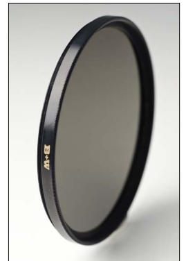
FIGURE 12.6 A B+W 77mm 0.9 ND filter.

To see more B+W filters, check out www.schneideroptics.com .