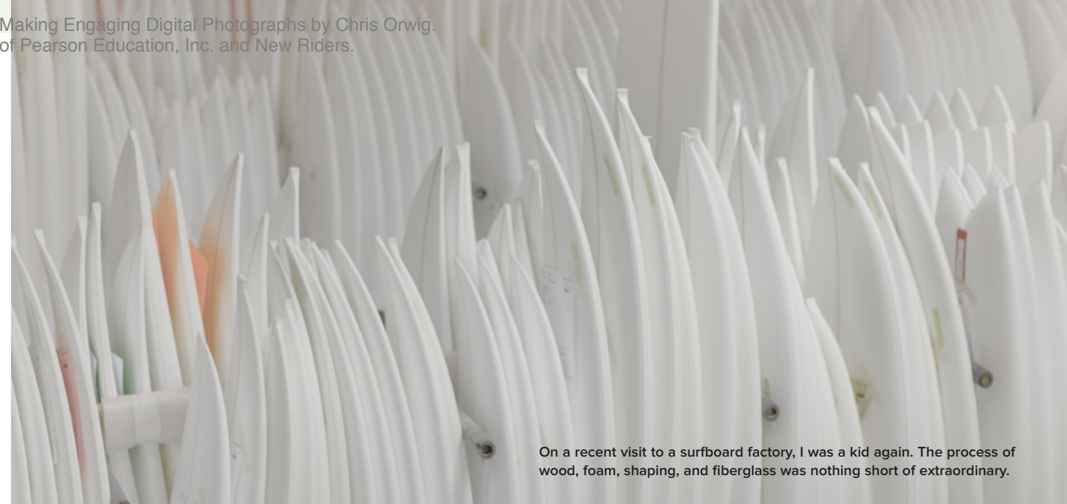
On a recent visit to a surfboard factory, I was a kid again. The process of wood, foam, shaping, and fiberglass was nothing short of extraordinary.

On most occasions, I would have simply skimmed over such a detail. That night the words traveled beyond my mind and all the way to my heart.