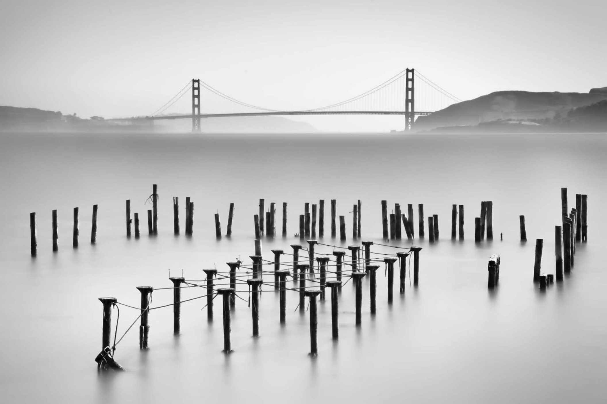
Angel Island: A 30 second exposure smooths the waters of the San Francisco Bay. Canon 5D mark II, Canon 24-105mm f/4L, 30 sec, f/18, ISO 100, 82mm, B+W 10-stop neutral density filter