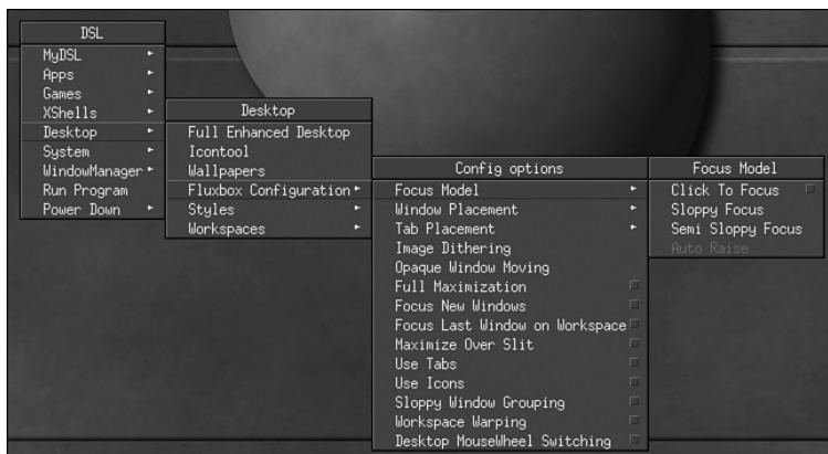
FIGURE 1-2 Customize your desktop settings from the DSL menu.