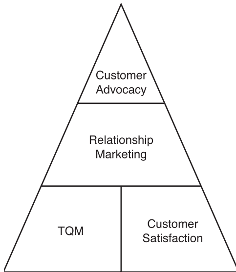
Figure 1-2 The Advocacy Pyramid

recommend. Advocacy is supported in the middle by relationship marketing because CRM provides the tools needed to personalize your company's advocacy relationship with each customer. The pinnacle is advocacy.